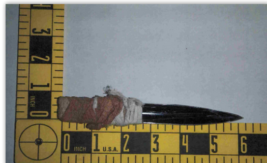
Photo 2. The second makeshift weapon. Photographed by CDCR staff on February 24, 2026.