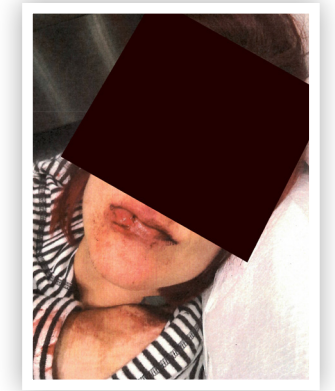
The girlfriend on the night of the altercation: the injury to her lower lip.

The girlfriend stated she passed out briefly and regained consciousness to find that her thumb, bloodied and maimed, was now missing the entire tip, down to the first joint. According to the girlfriend, the officer was fleeing the scene in his truck, driving at a high rate of speed through the parking lot, leaving her screaming, battered, and bleeding. As the officer waited for the automatic gate to open so that he could drive out of the parking lot of the apartment complex, the girlfriend yelled, "My thumb is gone!"