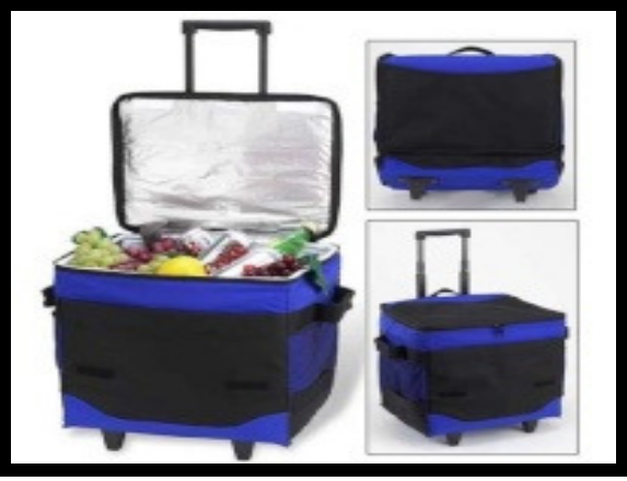
Over-sized rolling lunch container used by staff. (Not to scale.)

Staff and contracted employees bring cell phones into prison utilizing several methods including hiding the small devices on their persons and in over-sized rolling lunch containers, briefcases, file boxes, and backpacks. Some institutions are now using container measuring devices, also known as lunch box assessors, to limit the size of personal items entering the prisons. If these items do not fit into the assessor, they are not allowed into the prison. Concealment on their person has proven the most effective method because staff are rarely searched due to the cost and logistics of searching hundreds of employees. In one incident, a female contractor placed seven cell phones in her bra in an attempt to smuggle them into an institution.