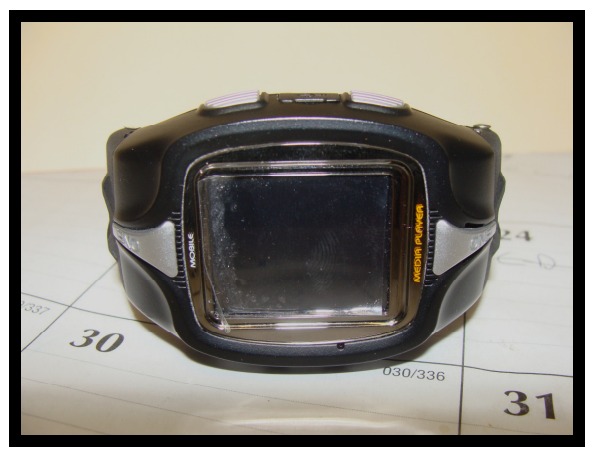
Mobile-Media Player cell phone wristwatch confiscated from inmate.

Once received, the compact size of cell phones allows inmates to easily conceal them from correctional staff in their cells or a common area on the facility grounds. On at least two occasions, correctional staff confiscated cell phones that resembled wristwatches from inmates. Inmates often hide cell phones in fans, light fixtures, books, mattresses, the walls of their cells, sinks, toilets, or shelving units.