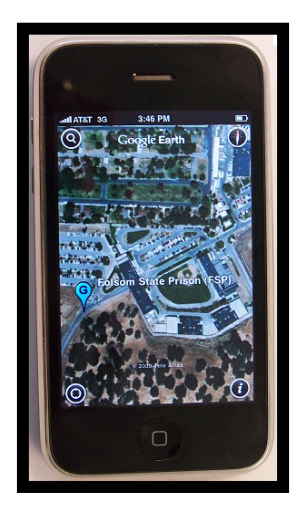
iPhones depicting web capabilities and satellite image of Folsom State Prison.

In an effort to corroborate the ease of which an inmate can communicate with cell phones, the OIG staff created a fictitious identity on the Internet, posed as a female, and corresponded with seven inmates housed in prisons throughout the state. We effortlessly located some of the prisoners' web pages depicting inmates in various forms of dress, and posing with fellow inmates. Using the undercover identity, our staff engaged in virtual dialogue with inmates who were using data-enabled cell phones from inside prisons.