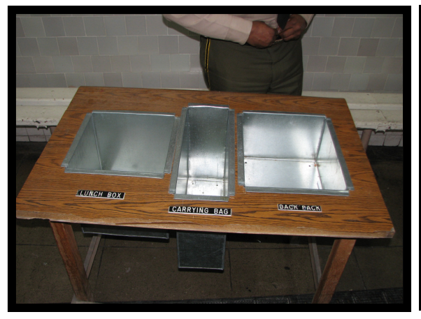
LUNCH BOX ASSESSOR – Left to right Lunch Box (12" wide x 12" long x 12" deep); Carrying Bag (6" wide x 18.25" long x 14" deep); Backpack (12" wide x 15.25" long x 8" deep.)

It is becoming common for inmates to hide cell phones and chargers at their work sites so if discovered, they cannot be readily traced to them. Recently, a prison's Investigative Services Unit conducted a search of its Prison Industry Authority facility and discovered a large tactical bag containing 22.7 pounds of tobacco, 1.8 pounds of marijuana, 35 cell phones, and one glass smoking pipe.