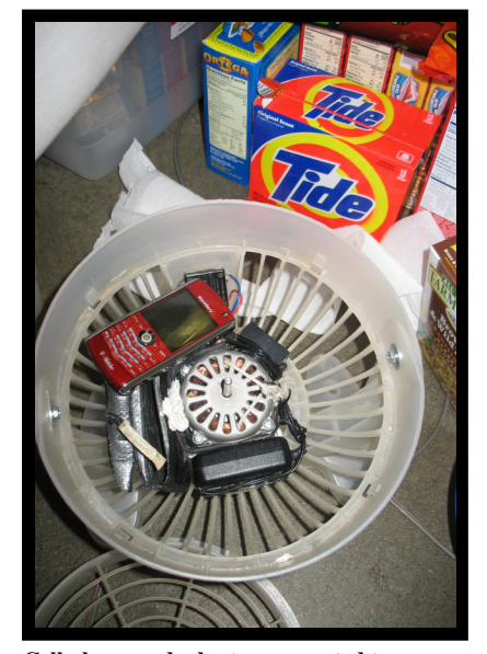
Cell phone and adaptor connected to electric desk fan motor to charge battery.