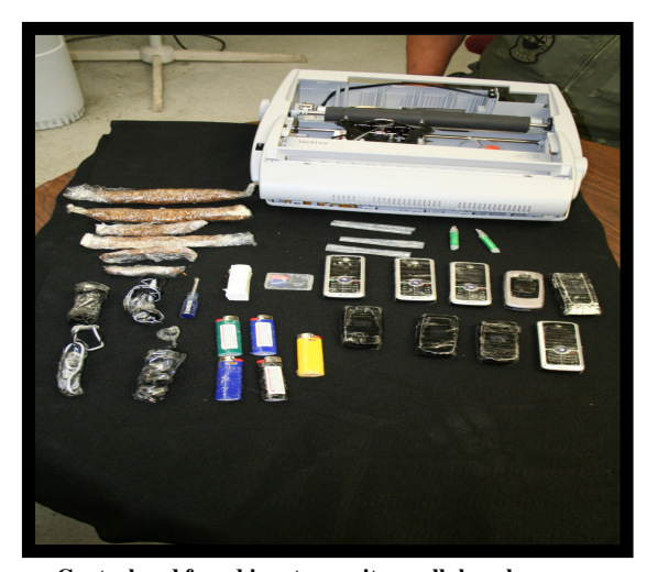
Contraband found in a typewriter: cellular phones, weapons, lighters, and tobacco.

Inmates' friends and family members have developed a variety of methods to smuggle cell phones into prisons. One of the newest techniques is to circumvent security measures by intercepting quarterly packages<sup>1</sup> from state approved vendors, stuffing them with cell phones, resealing the box, and forwarding it to the inmate. These phones are concealed inside of DVD players, televisions, radios, typewriters, books, toilet paper, cereal products, and various other items. If the received package is from an approved quarterly vendor and appears intact, Department staff will deliver it to the inmate.